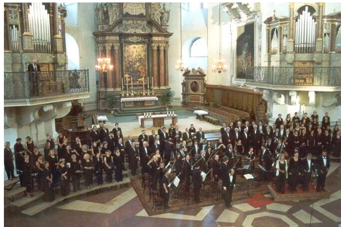
Salzburg Dom Choir & Orchestra

Transfer to Vienna airport for return flights to the USA. Arrive home in the evening of the same day.